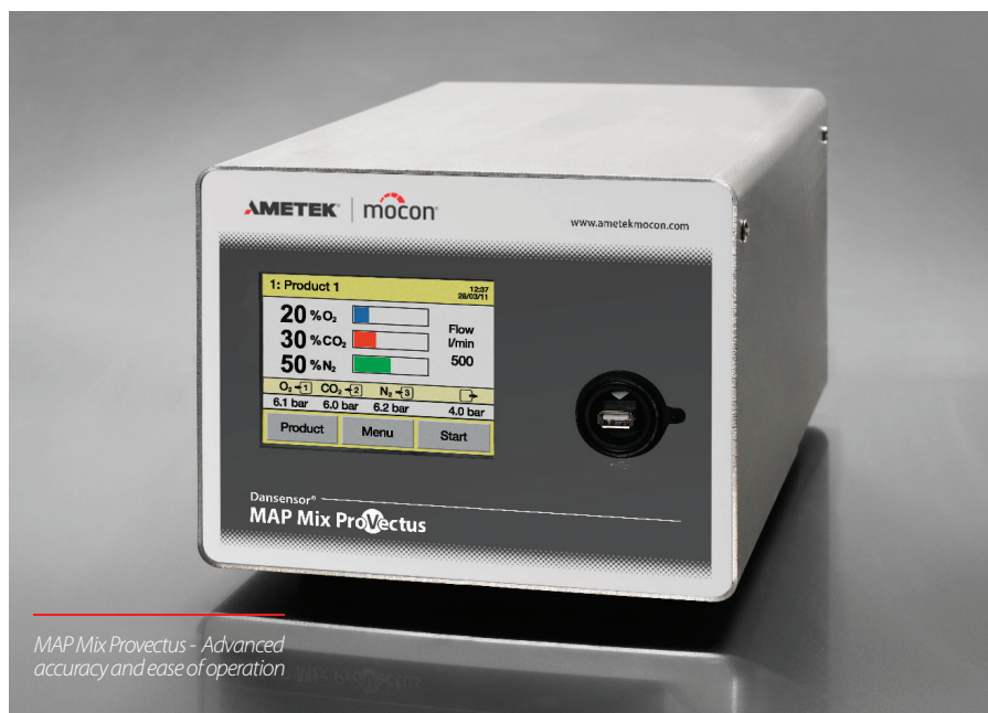
MAP Mix ProVectus - Advanced accuracy and ease of operation