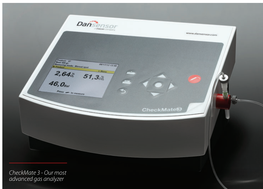
CheckMate 3 - Our most advanced gas analyzer